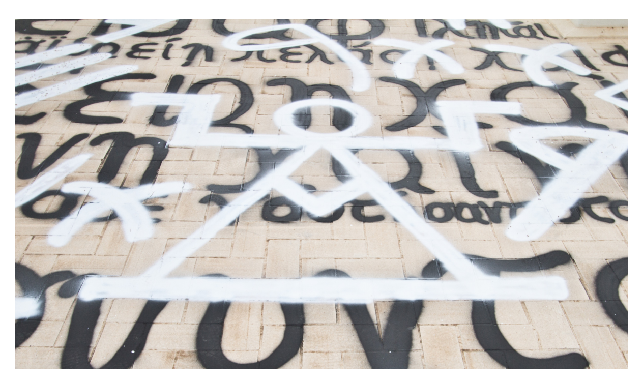
representations of the phoenician tanit goddess worshiped as the goddess of fertility, life and death, and symbol of ibiza