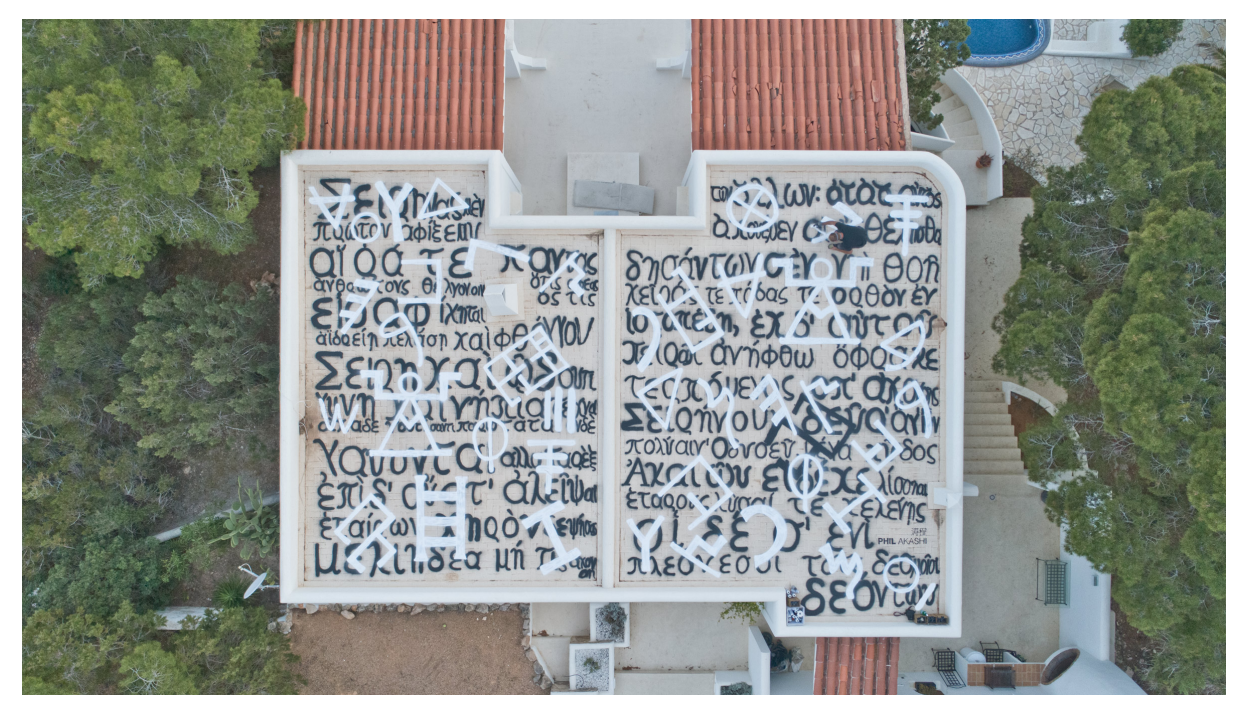
all images courtesy of phil akashi

the small, uninhabited island of es vedrà in the balearic sea has become phil akashi's inspiration for his latest sitespecific project entitled, 'mystical es vedrà'. located off the south coast of ibiza, the rocky outcrop is best known for the myths and legends which surround it – most notably the ancient greek poem, homer's odyssey. with reference to this, the artist's monumental work adorns the rooftop of a villa in ibiza, overlooking es vedrà, with parts from the epic poem and symbols from other related civilizations and cultures.