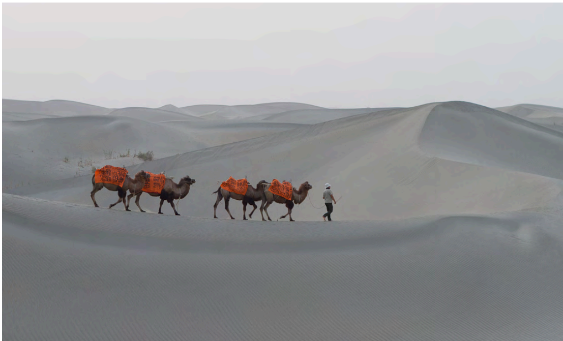
Aerosol spray on traditional Uyghur silk – Taklimakan Desert, Xinjiang, China 2015.

I did for instance a project with the Uyghur ethnic group in the Taklimakan desert where I spray-painted on traditional Uyghur silk on a caravan of camels. The Taklimakan desert was one of the great obstacles in the path of the Silk Road Merchants on their way to the Middle East so I thought it was a nice way to celebrate the region’s textile culture, its people, and its nature. The trading activities along the Silk Road have facilitated the transmission of goods, ideas and culture over many centuries and I am happy to sustain this tradition with my own artistic language.