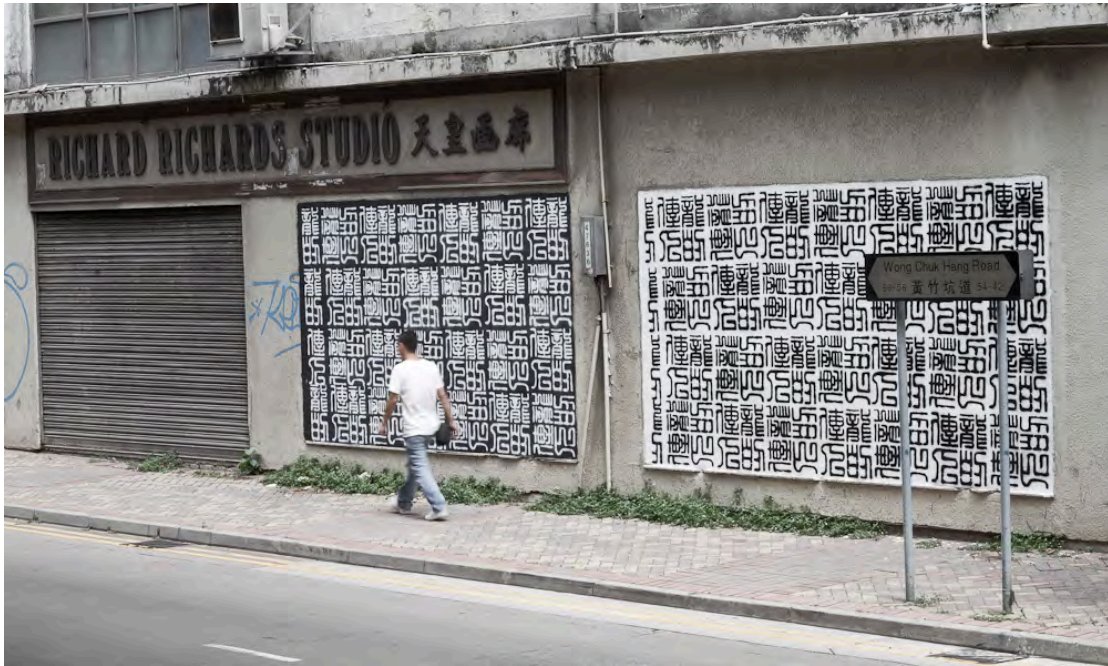
Wong Chuk Hang, South Island Cultural District SICD – Hong Kong 2015.

For the second chapter, I went to the Xinjiang Uyghur Autonomous Region to meet several ethnic minorities such as the Kyrgyz, Tajik and Uyghur and to create some innovative street art pieces in the mountains and in the nature. Larger than Alaska, Xinjiang is a land of extremes and bounty with a complicated, intriguing history, a complex network of ethnic groups, and a rich artistic, musical, gastronomic heritage. The largest group is composed of Uyghurs and the term Uyghur means “confederation of 9 tribes”.