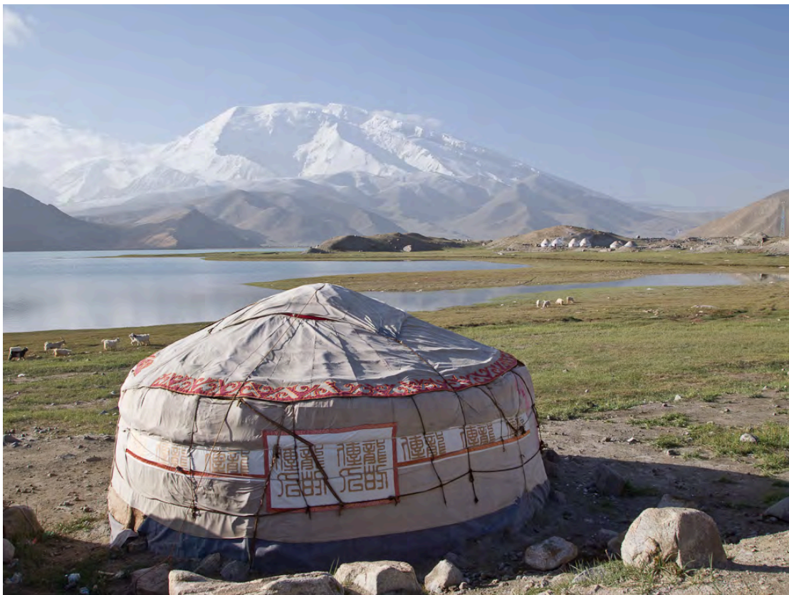
Aerosol spray on traditional Kyrgyz yurt - Karakul Lake, Xinjiang, China 2015.

As a Belgian artist living in Asia, I am always looking to further deepen my interest and understanding in Asian cultures. I also want to play my role as an artist and question with respect the contemporary world. Escaping the studio and traveling across the People's Republic of China, I will try to push the boundaries of Street Art to open up a dialogue with the Han majority and local ethnic minorities. Through creative approaches and techniques, I will also try to engage with nature, civilization and local cultures, and eventually aim to go beyond existing definitions of art. After each chapter, I will come back in the studio and create artworks related to the local experience. And the project will grow and evolve during my journey.