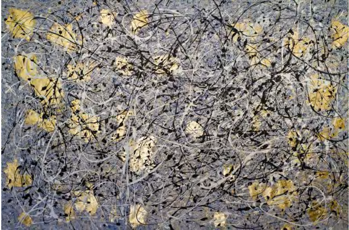
WISDOM OF HAPPINESS. Mixed media on canvas with Chinese characters: 囍/"Double Happiness", Hong Kong 2015. 78.7"x118.1" 200x300cm.

For the series final chapter - Wisdom of Happiness – I gathered elements of the two first chapters, then carefully added gold leaves and thin layers of acrylic using a bamboo stick. The Rings on Fire series ends ultimately with a spiritual question: is marriage both a cause and an effect of happiness?