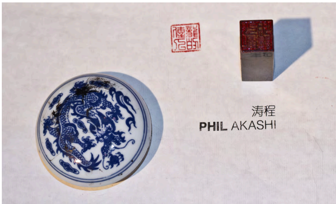
Traditional seal with Chinese characters "龍的傳人" / descendants of the dragon.

Inspired by the legendary creature of the dragon, the project will integrate a series of unsanctioned and commissioned artworks integrating the dragon as a spiritual symbol of the Chinese unity and pride for the country. These artworks will be composed of traditional seals imprints with Chinese characters "龍的傳人" / "Descendants of the Dragon". I found a seal in a market a couple of years ago with these characters and that's how I started to research about the dragon and its meaning in Chinese culture.